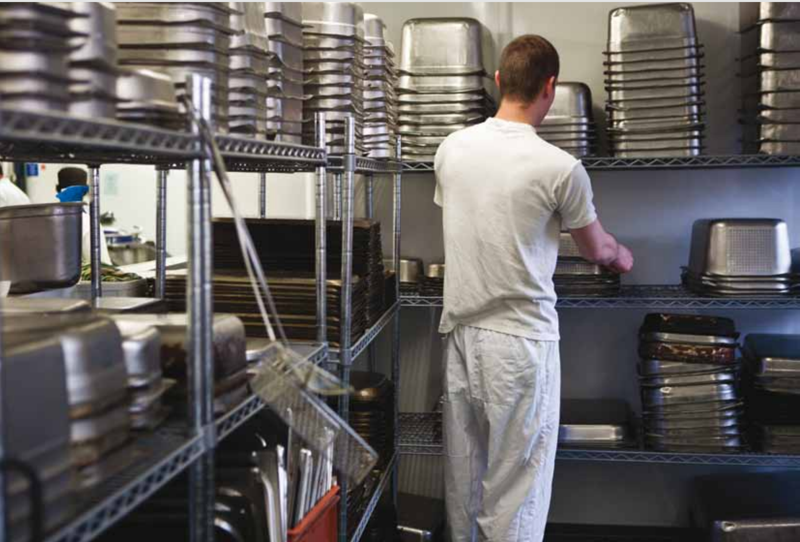
Working in the prison kitchen. HMP Aylesbury