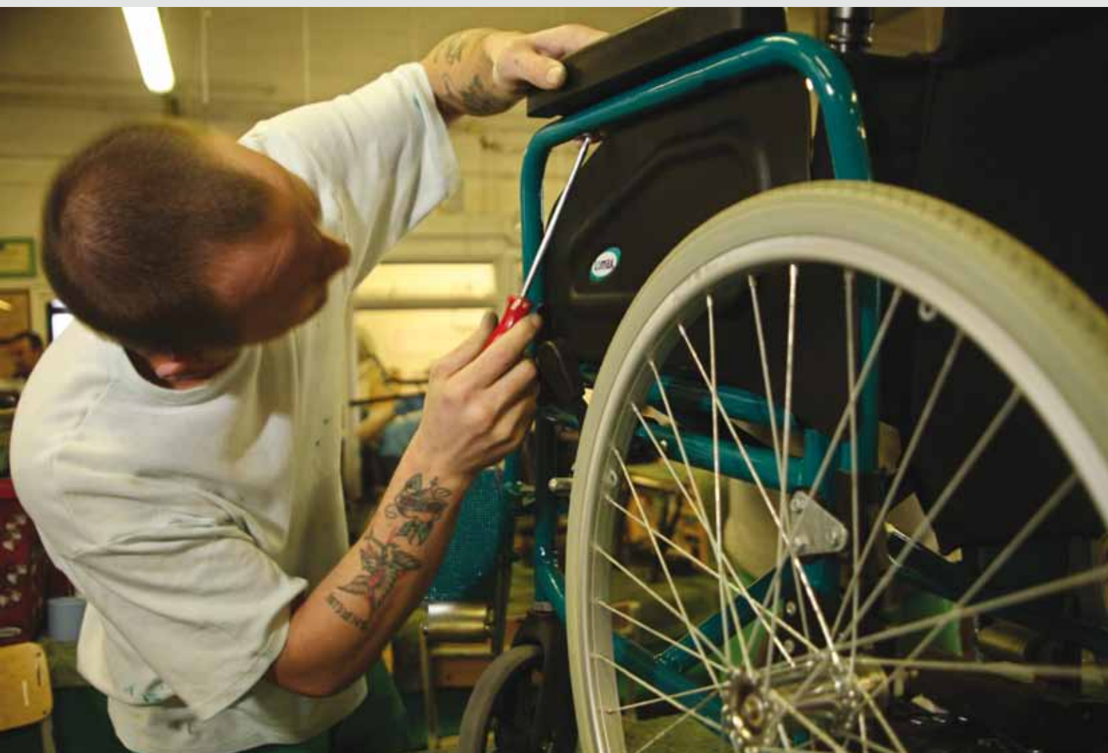
Rebuilding a wheelchair at the Inside Out trust workshop. HMP Liverpool